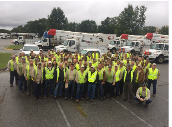
*Exercise Exercise Exercise*